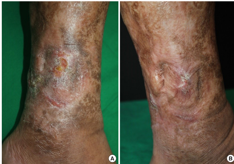
Fig. 3. Results after the treatment. (A) Two months and (B) 4 months after steroidal treatment.

ment of PG's pathophysiology [8], and this is supported by the efficacy of immunosuppression with systemic steroids and cyclosporine in treating PG. Furthermore, inflammatory and autoimmune responses are exacerbated in ischemic conditions such as venous insufficiency [9].