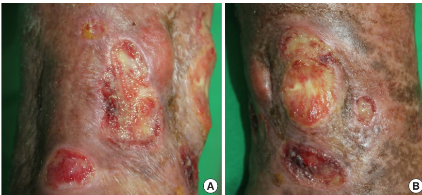
Fig. 1. Multiple necrotic ulcers with purplish, elevated borders. (A, B) Leg edema surrounded by a brownish, reticular pigmented patch was also present.

The mechanisms and pathophysiology of PG are elusive and likely multifactorial. An accepted and validated diagnostic criterion for PG is still lacking [7]. An anomalous autoimmune or inflammatory response is believed to be the main compo-