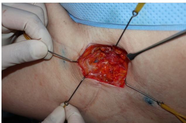
Fig. 2. Indigo carmine dye injection. Confirmation of the exact source of lymphorrhea by subcutaneous indigo carmine dye injection.

intraoperative indocyanine green (ICG) lymphography, along with a blue dye injection, LVA was performed under local anesthesia (Fig. 2). Under intraoperative ICG lymphography, a ruptured lymphatic vessel and a nearby healed lymph node were observed and dissected for anastomosis. An end-to-end LVA with intravascular stent technique using 5-0 nylon suture was performed between the lymphatic vessel and a superficial vein in the left inguinal area [7] (Figs. 3, 4). The caliber of the lymphatic channel was 0.6 mm. The postoperative ICG lymphography revealed intact lymph flow from the lymphatic vessel to the superficial vein (Fig. 5). The postoperative course was uneventful during two months' follow-up, and lymphorrhea had completely disappeared from the first day after the procedure.