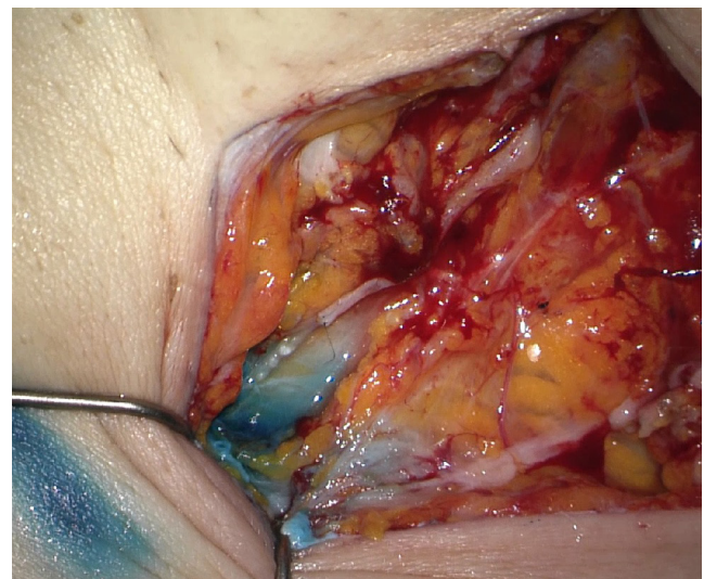
Fig. 4. Photographs obtained after LVA. The caliber of the lymphatic channel was 0.6 mm.