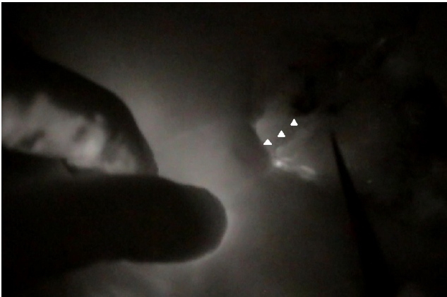
Fig. 5. Post LVA ICG lymphography. White triangles indicate lymphatic flow along the microanastomosis site.