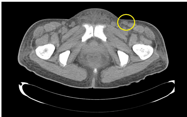
Fig. 1. Computed tomography scan performed before lymph node biopsy. We could localize superficial lymph node preoperatively.

Fourteen days after the lymph node biopsy, after performing